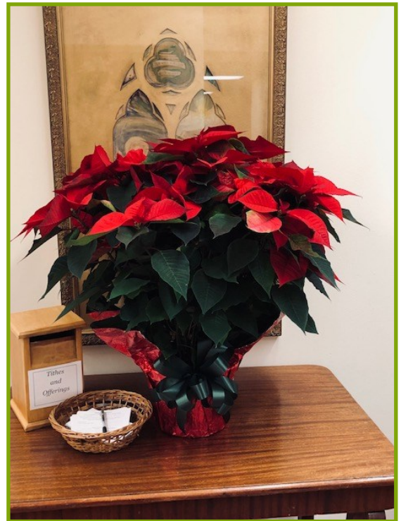
Large Poinsettia from the Frazier Group